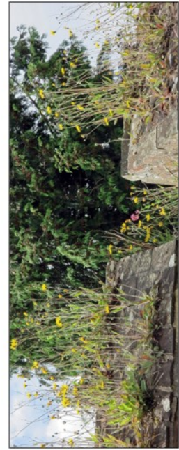
Figure 176. Hieracium pollichae Plants in wall-top habitat at Chichester (v.c. 13).

Sell & Murrell (2006) gave the maximum number of capitula as eight, but many of the plants in Chichester, especially those on East Walls, have large inflorescences with up to 16 capitula as indicated in the above description.