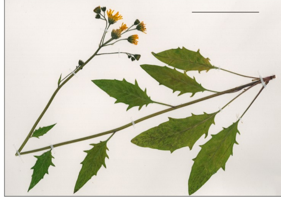
Figure 177. Hieracium pollichae Specimen from Chichester (v.c. 13) showing the dark blotching on the leaves.